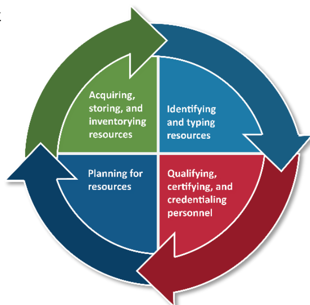
Resource Management Preparedness Process